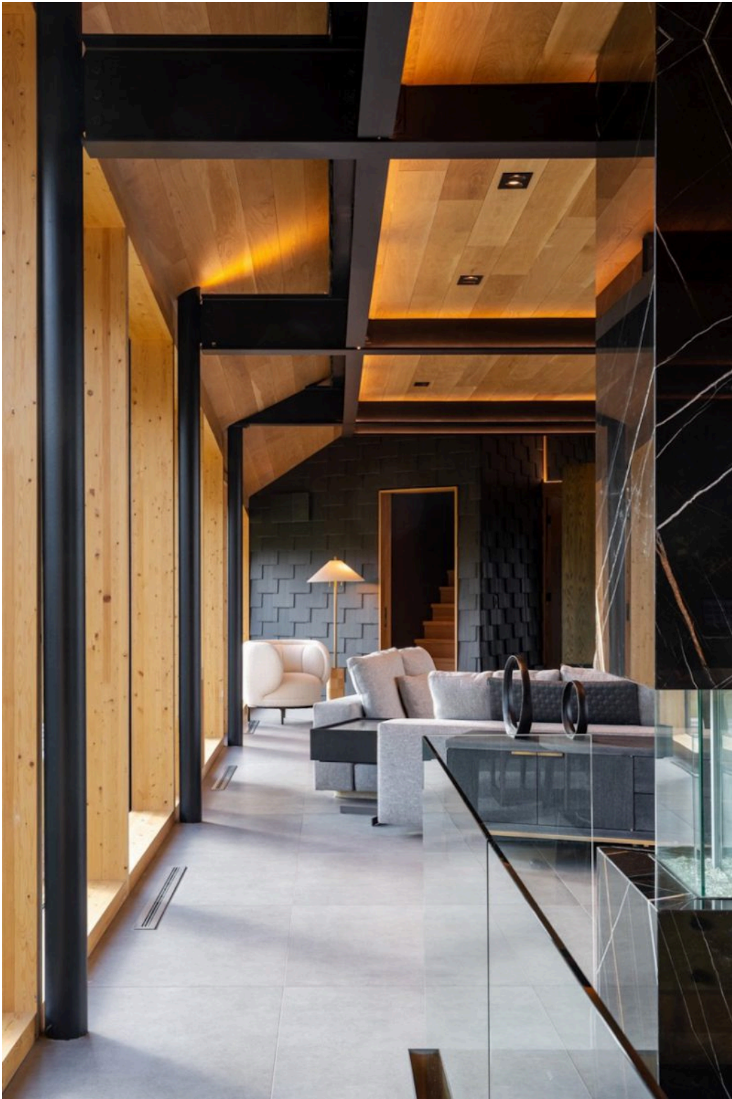
Forest Retreat, by Kariouk Architects