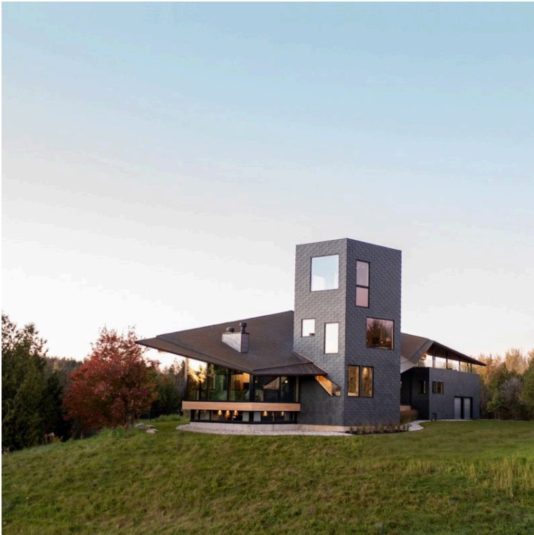
Forest Retreat, by Kariouk Architects