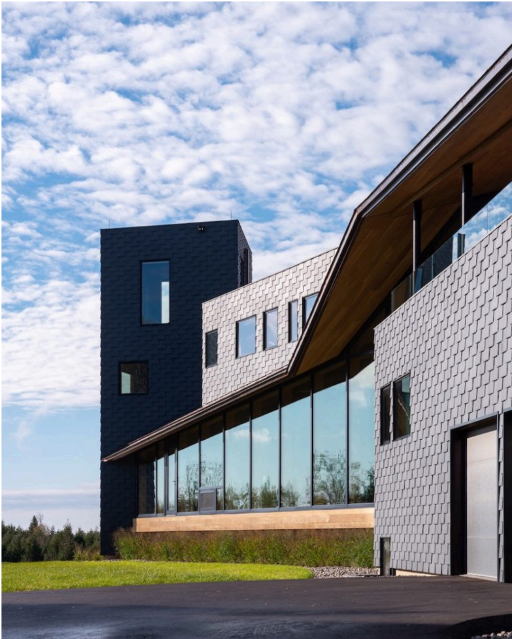
Forest Retreat, by Kariouk Architects