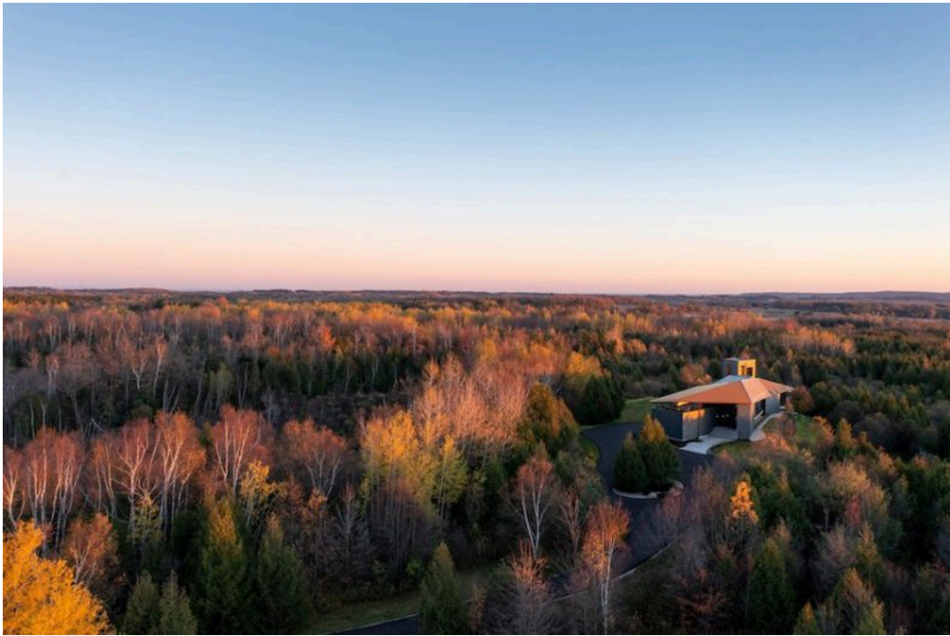
Forest Retreat, by Kariouk Architects