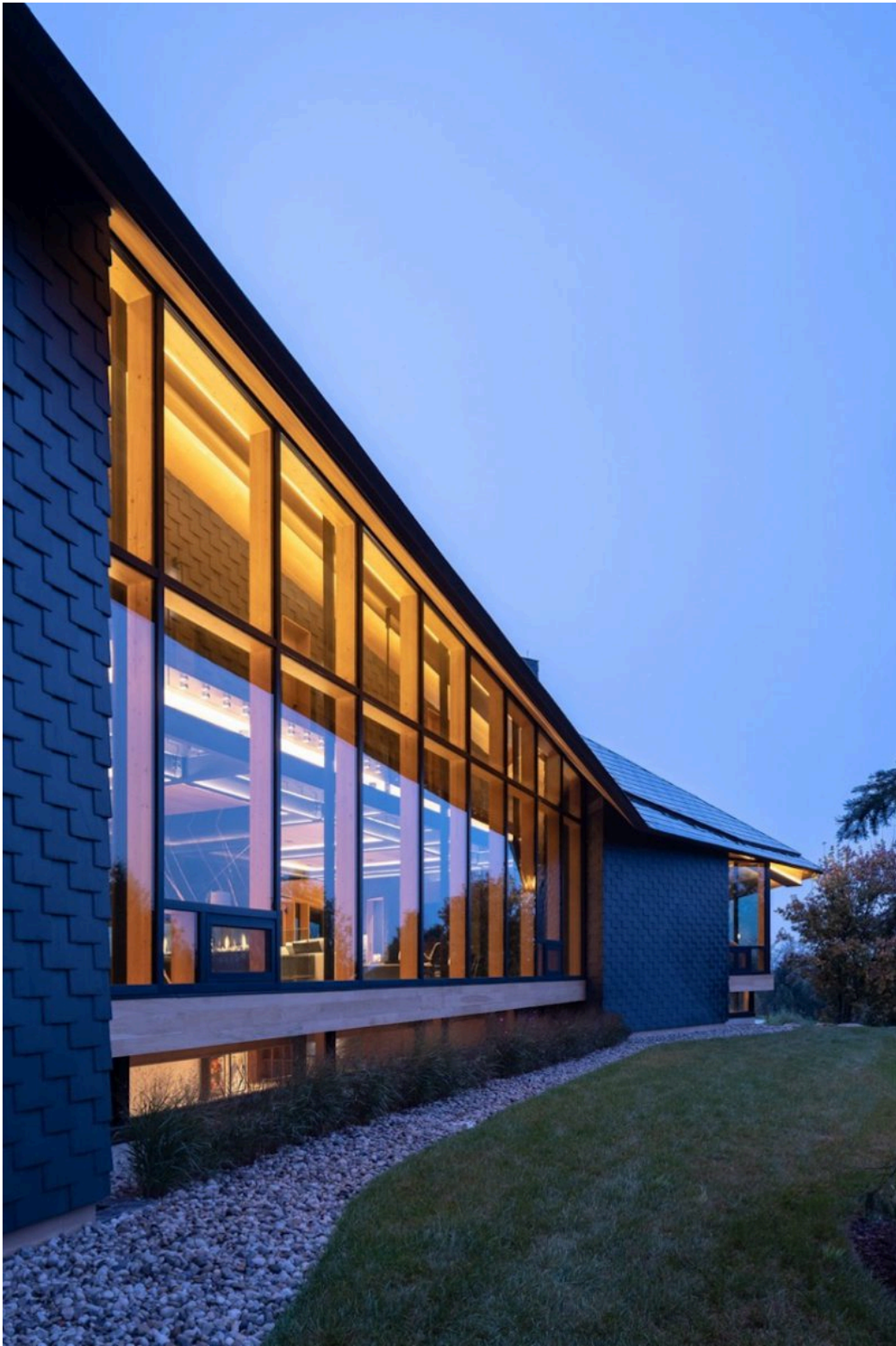
Forest Retreat, by Kariouk Architects