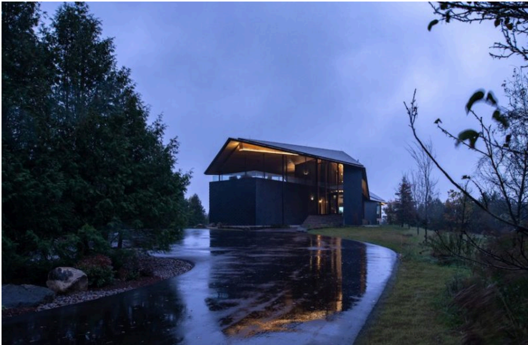
Forest Retreat, by Kariouk Architects