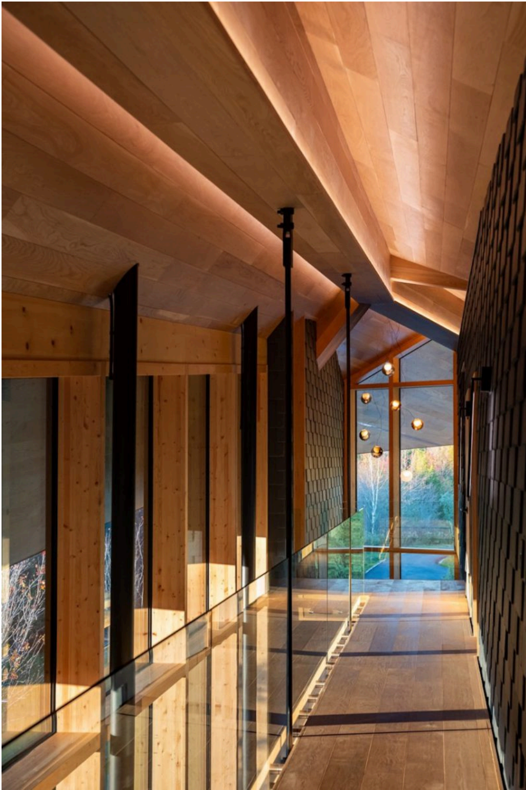
Forest Retreat, by Kariouk Architects