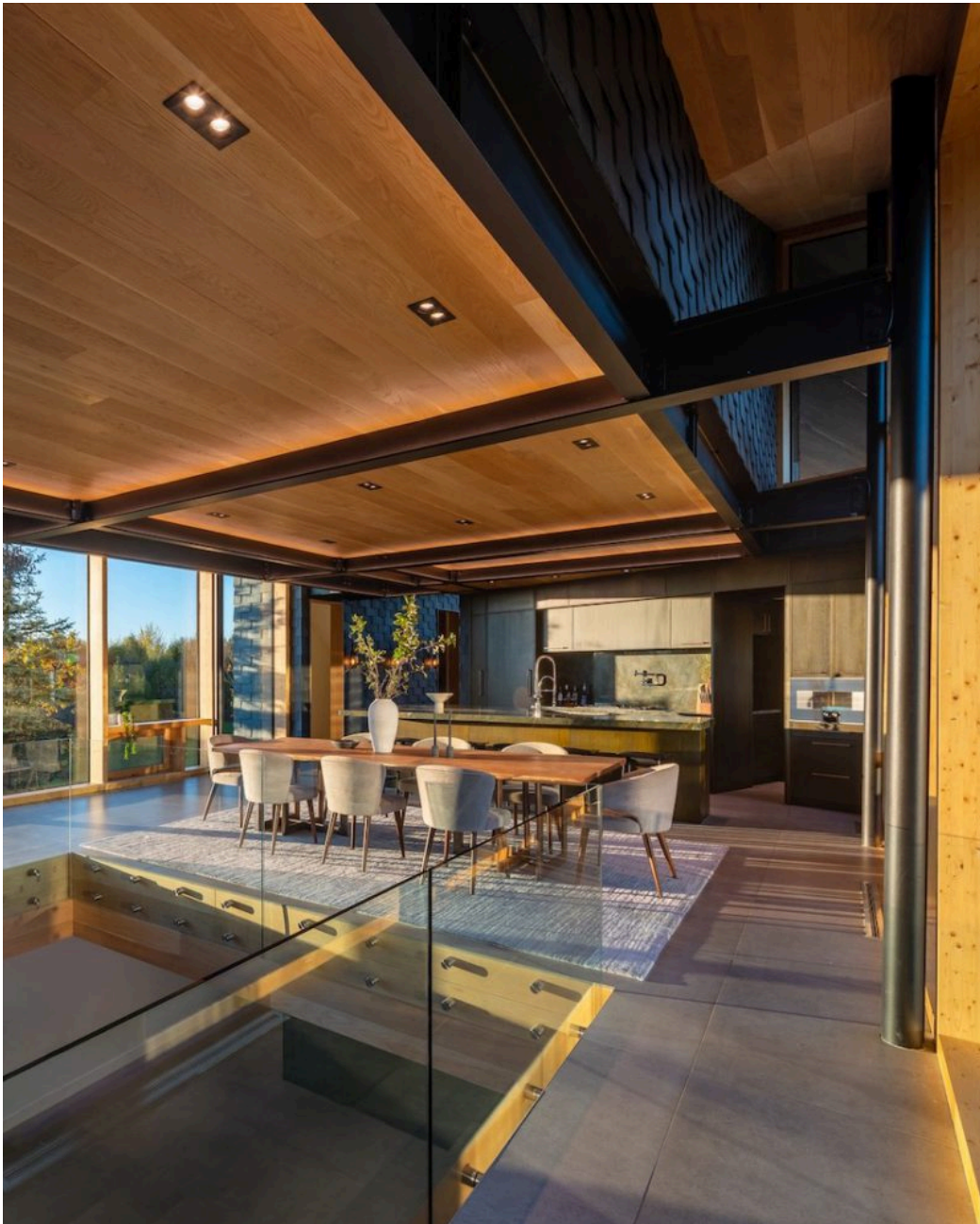
Forest Retreat, by Kariouk Architects