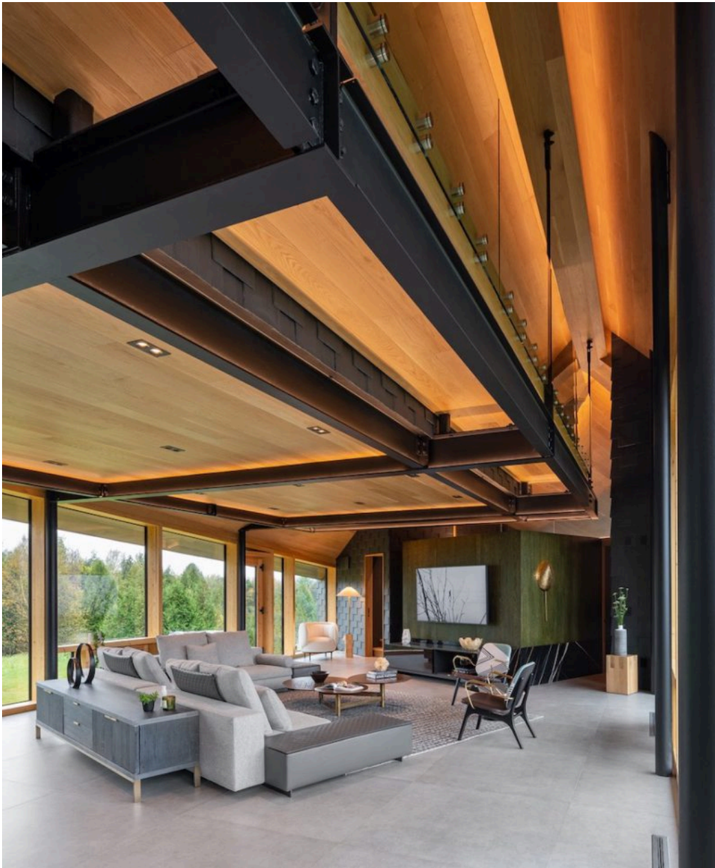
Forest Retreat, by Kariouk Architects