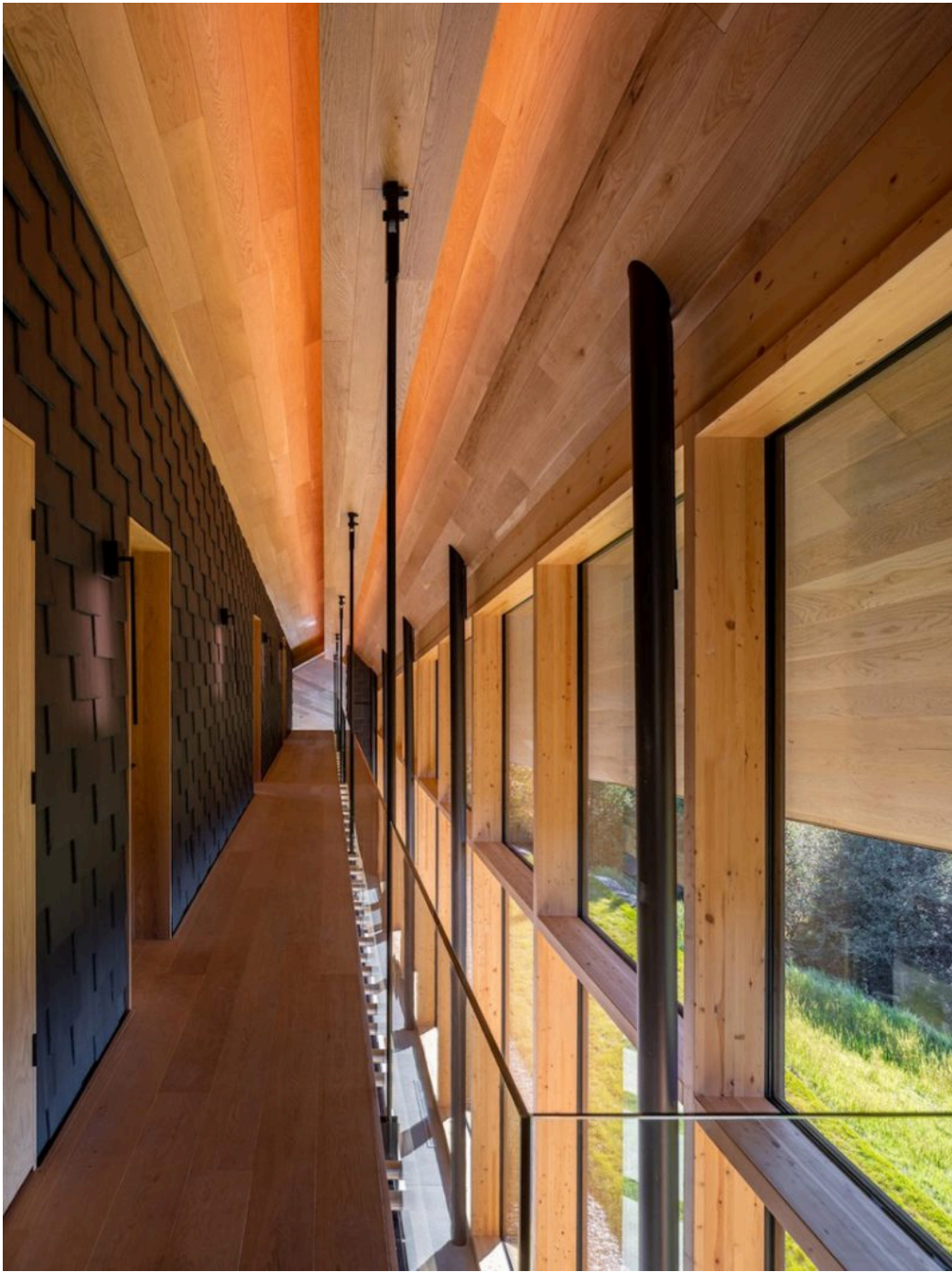
Forest Retreat, by Kariouk Architects