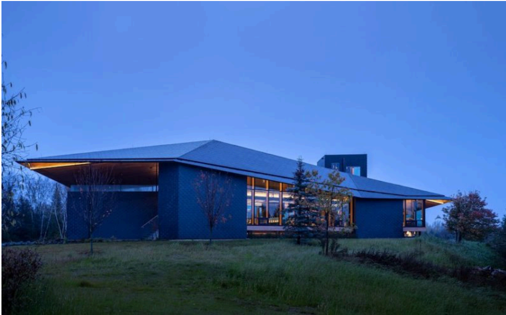
Forest Retreat, by Kariouk Architects