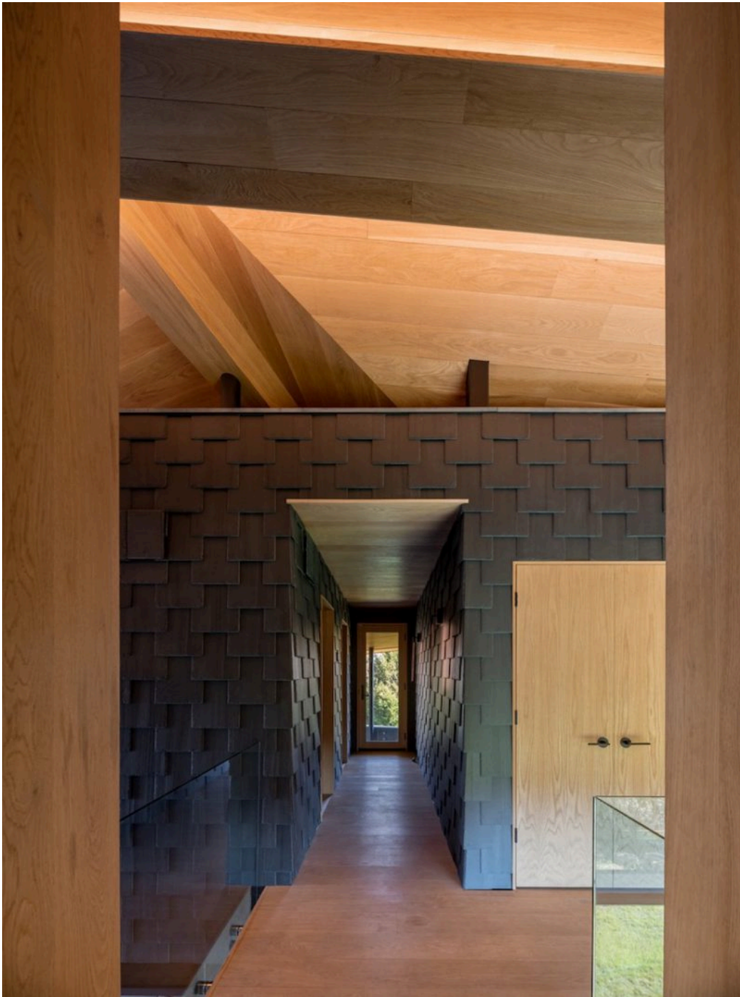
Forest Retreat, by Kariouk Architects