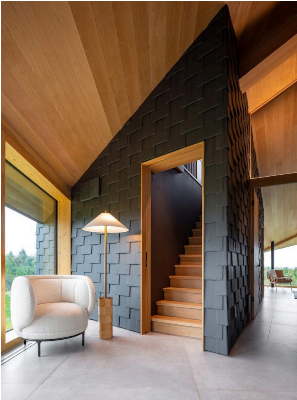
Forest Retreat, by Kariouk Architects