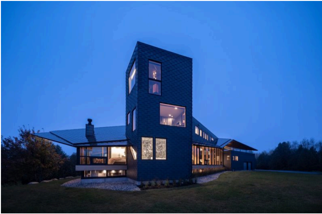
Forest Retreat, by Kariouk Architects