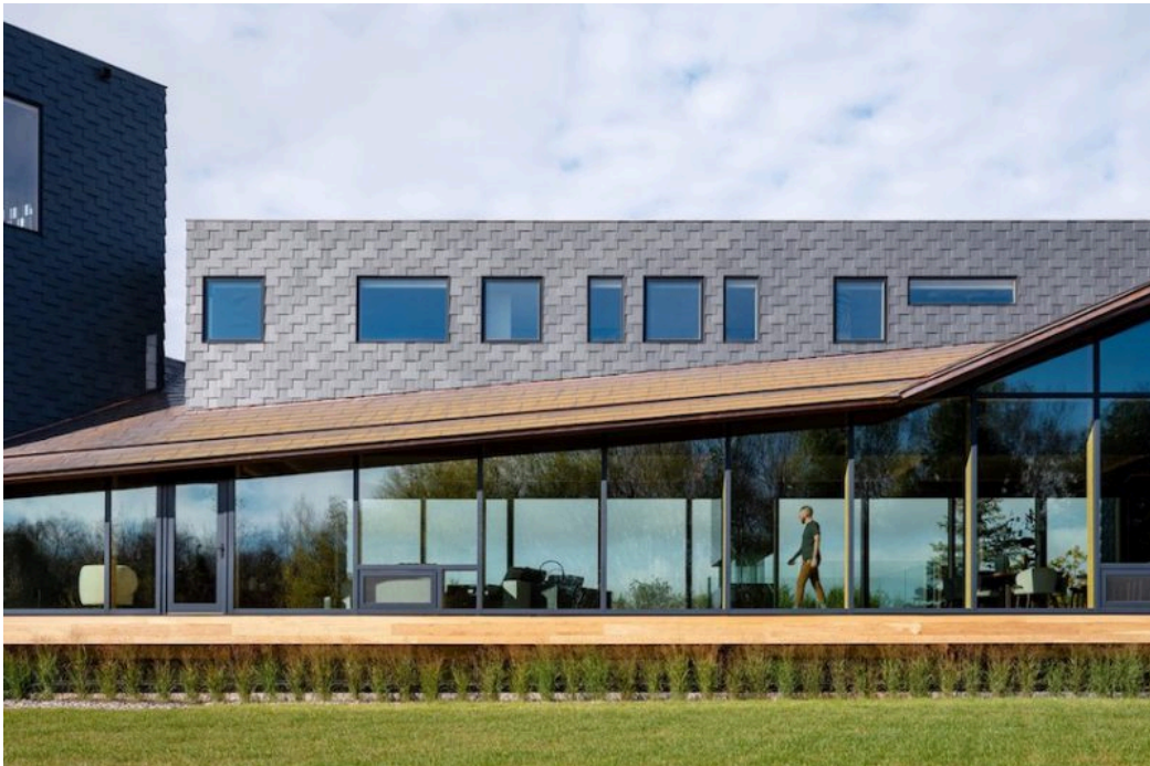
Forest Retreat, by Kariouk Architects