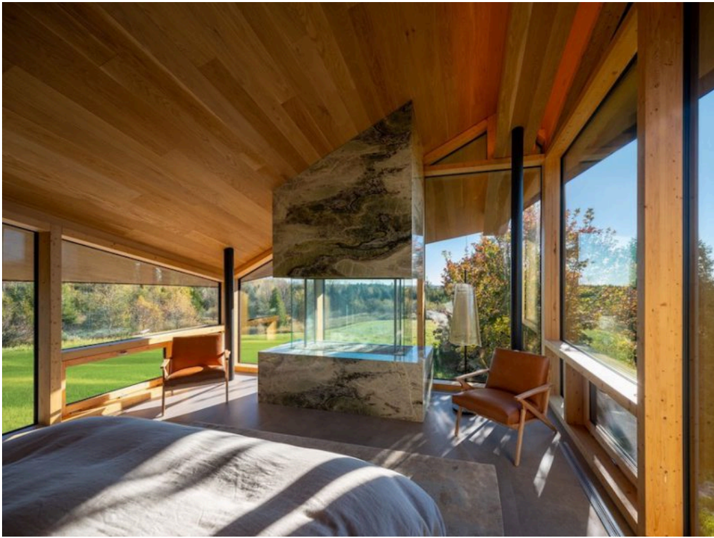
Forest Retreat, by Kariouk Architects