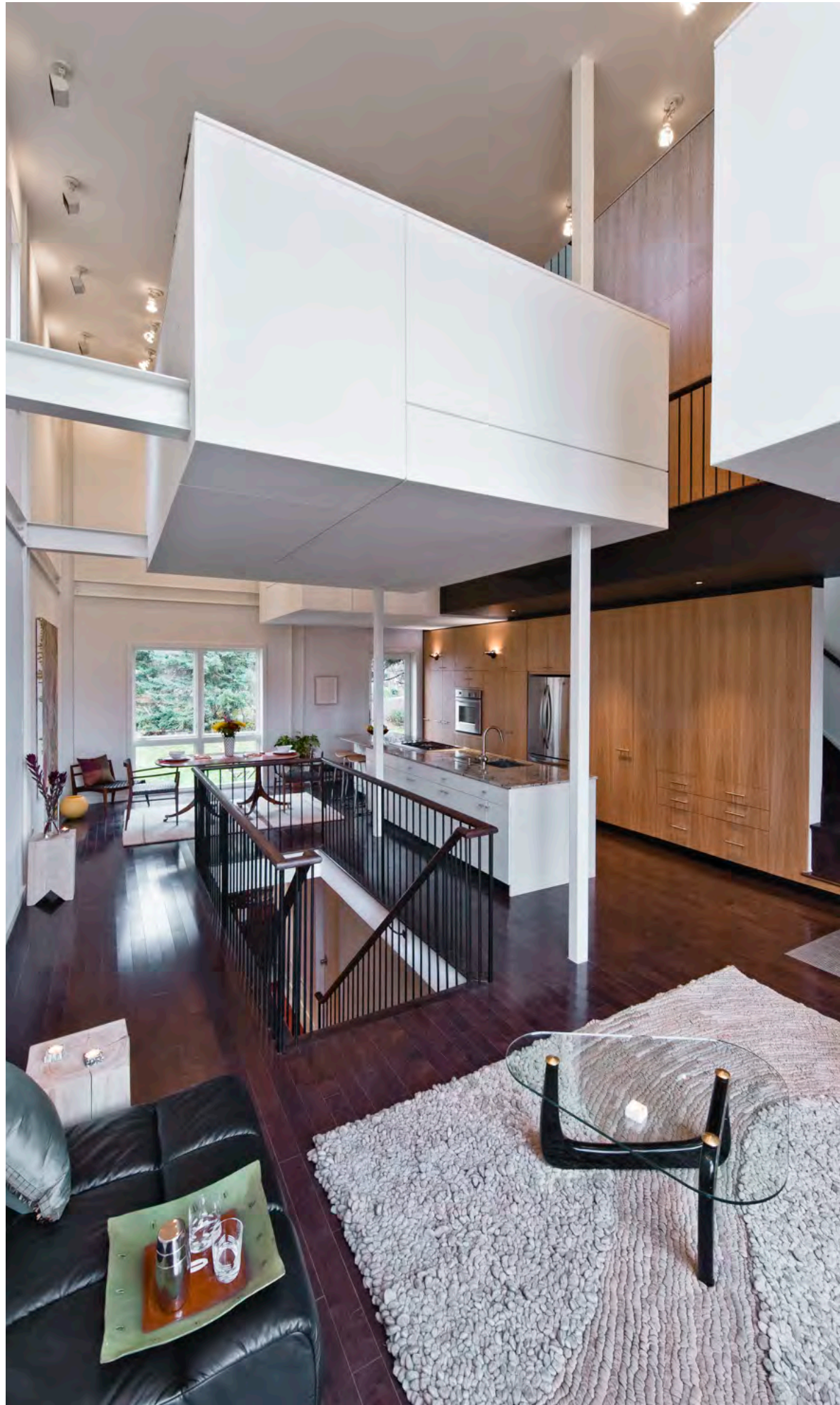
Echo House